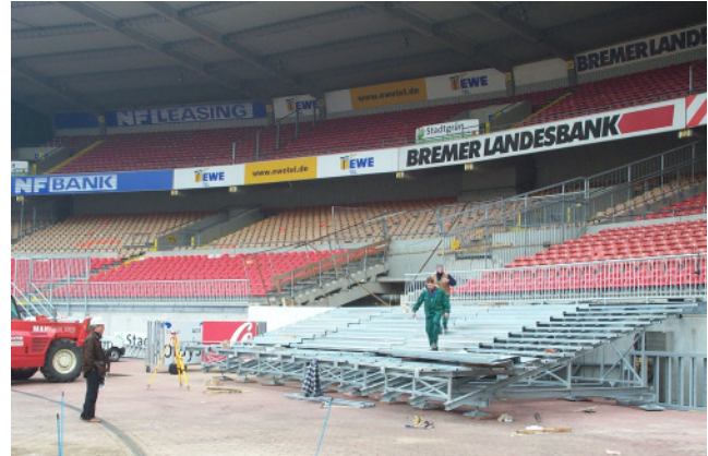
Joining of several elements