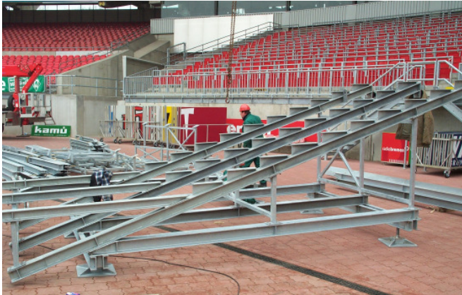
Pre-assembly of an element