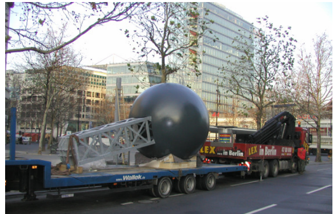
Delivery to the site in Berlin