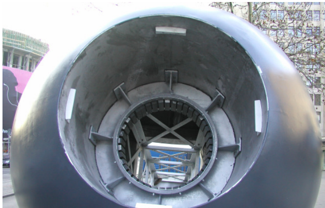
Fittings of the obelisk inside the sphere