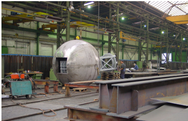
Assembly of the obelisk structure and the sphere