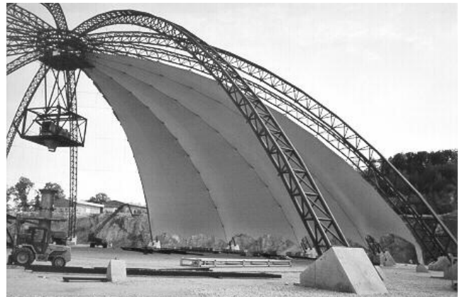
Partial installation of membrane