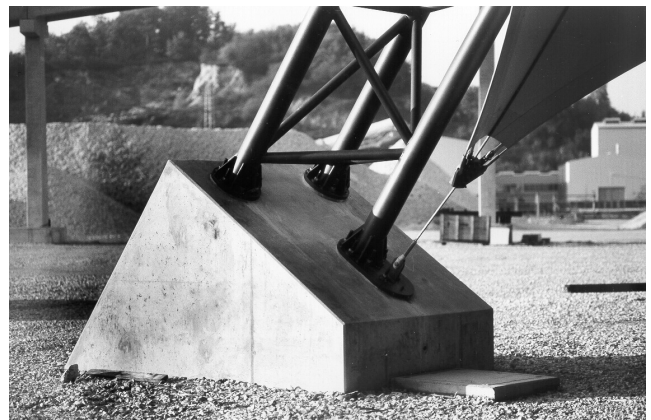
Base of a triangular truss