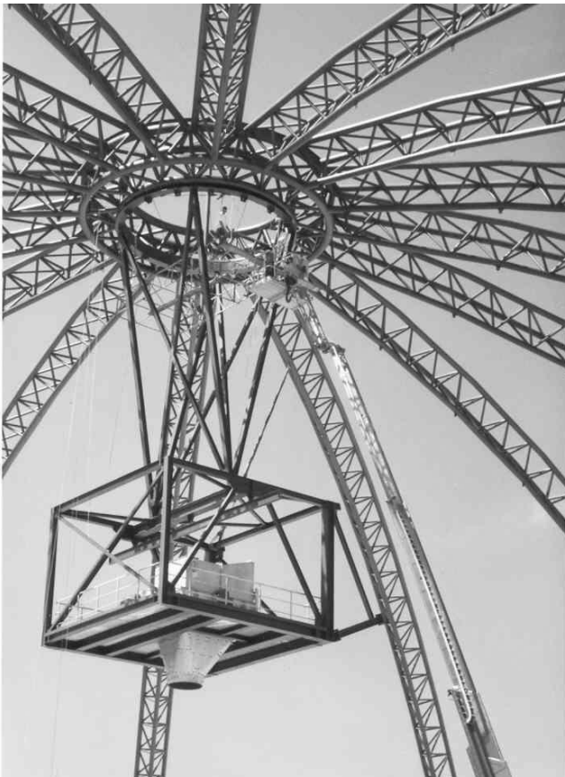
Centre of building: Triangular truss, compression ring and suspended bridge-element