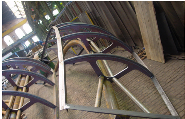
Girder for the discharge of smoke (in case of fire)