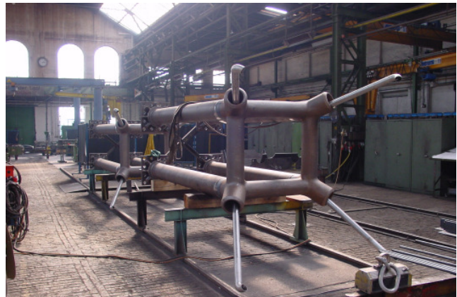
Tree-shaped supports with cast steel-gussets and drain-pipes