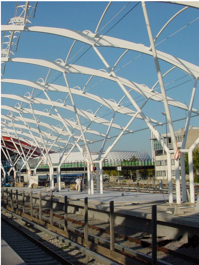
1 st phase of construction: Installation of steel-structure-halves